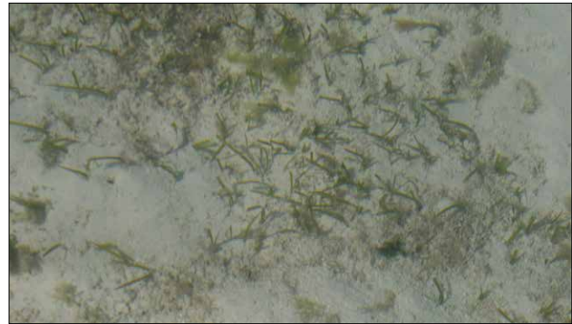
Fig. 4. View of the lagoon in Kavaratti Atoll during November 2015 where a dense bed of Cymodocea serrulata existed in 2011