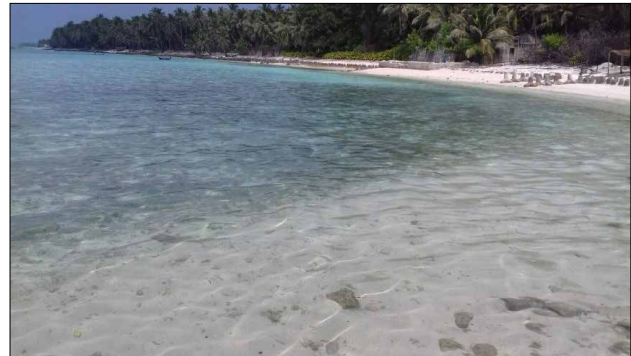
Fig. 5. View of seagrass meadow in the lagoon of Kiltan Atoll during November 2012.