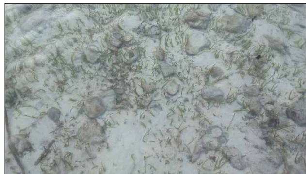
Fig. 6. Close up view of declining seagrass meadow in the lagoon of Kiltan Atoll observed during November 2015.