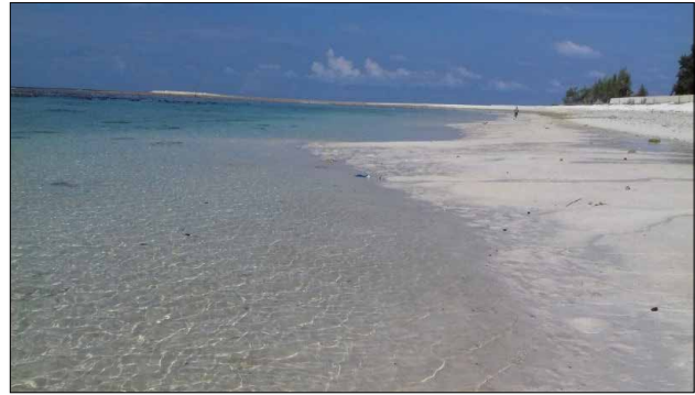
Fig. 3. View of vanished seagrass meadow in the lagoon of Chetlet Atoll during November 2015